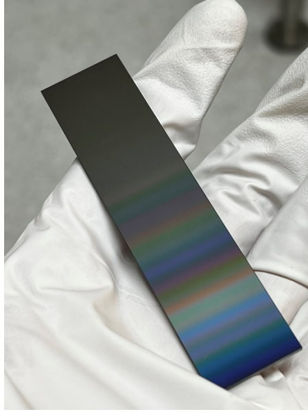
Figure 1: Full-size prototype of the MANTIS grating: a 96x23 mm VLS diffraction grating, with a 20 nm zirconium coating.